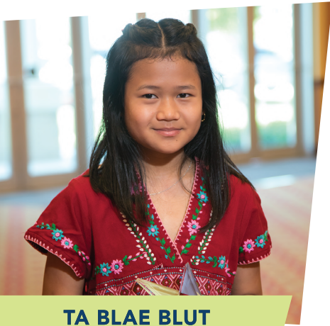
TA BLAE BLUT

Awards were presented to students who showed character, perseverance, outstanding leadership, overcame personal or academic obstacles and helped make their school a better place to learn.